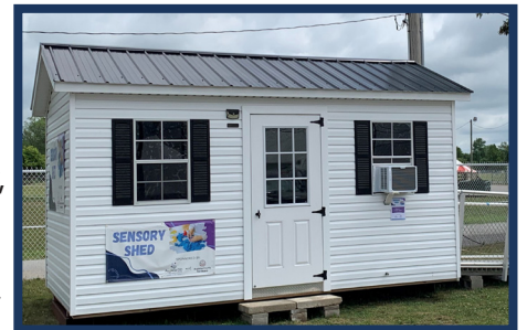
The Sensory Shed at the Auglaize County Fair.

We thank you for your support over the last 70 years and look forward to seeing you out and about in 2024!