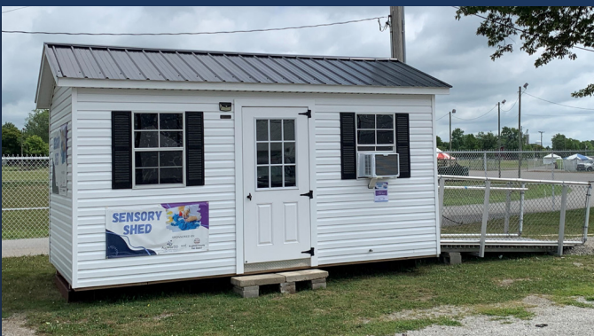
New Sensory Shed at the Auglaize County Fair!

Current and former staff, board members, friends, and colleagues gathered to celebrate 70 years of support during a building rededication and open house on March 31, 2023.