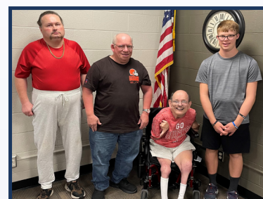
2022 Board Leadership Development Program participants.

We look forward to offering this program again in 2024 and have plans to expand to invite community members who may also have an interest in volunteering in service to Auglaize County. Please contact me at rkohler@auglaizedd.org with questions.