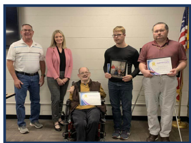
Participants received certificates of completion at the October Board meeting.

One of the strategic planning goals we achieved in the summer of 2022 was holding our first offering of the Auglaize DD Board Leadership Development Program. This three-session series was designed for individuals supported by Auglaize DD who want to build their knowledge of Board operations and may be interested in future service to Auglaize DD as a Board member.